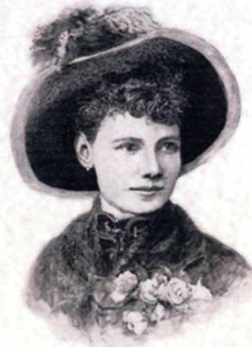
Frank Leslie's Illustrated Newspaper, January 1890 edition.