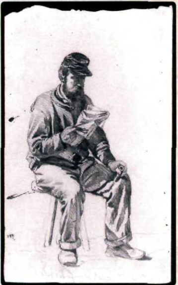
Reading the News - Off Duty Drawing by Edwin Forbes March 12, 1864