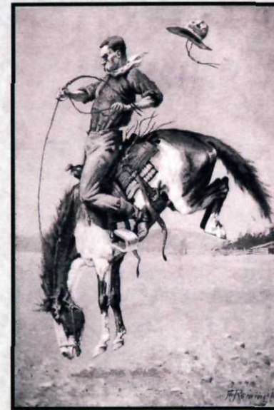
Painting by Frederic Remington circa 1908.